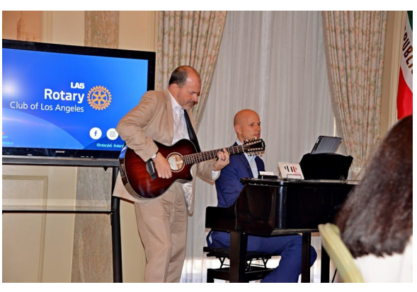
When your lunch ticket includes friends, motivating speakers AND musical entertainment, the cost is a steal!