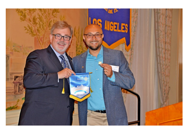
Visiting Rotarians are the best treat!