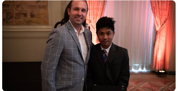
The Myanmar Water Project Committee continued their good work by partnering with organization HiTech who donated laptops to Myanmar recipients.