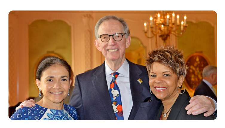
Rotary meetings are fun!